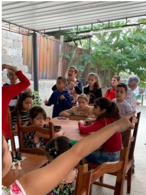
Playing dominos at a game day