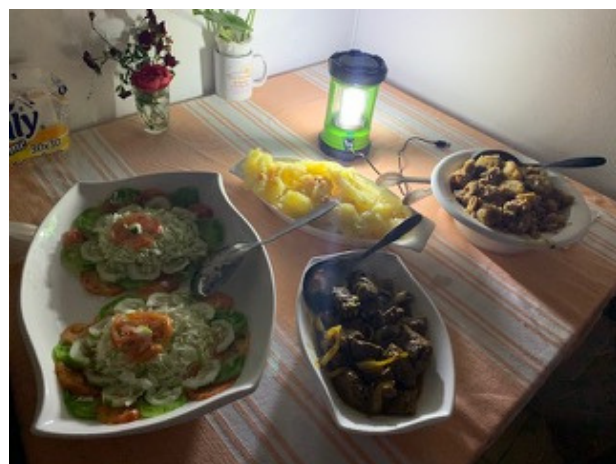
Eating by rechargeable lanterns