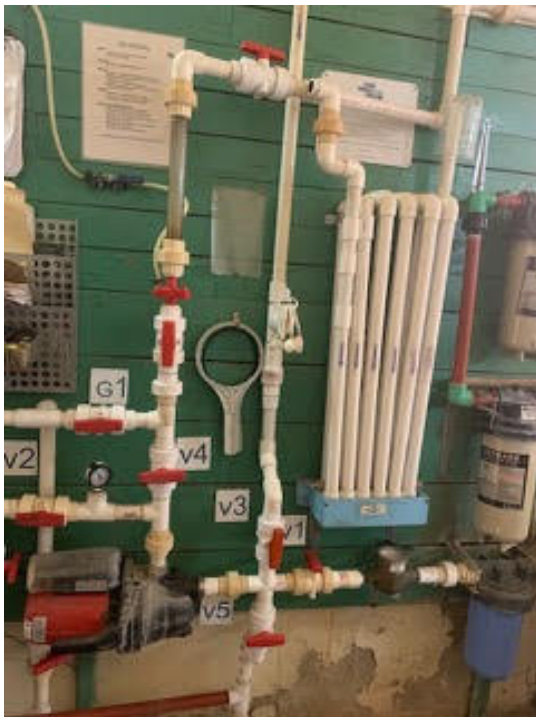
Water filtration system